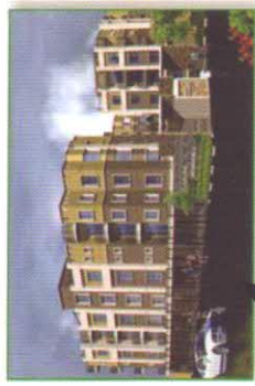
CA/9, Gobinda Niwas Jyangra, Kolkata- 700 059