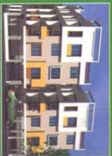
Purbalok, E M Bypass