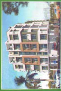
Sanjukta Apartment, Chinar Park