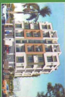
Sanjuka Apartment, Chinar Park