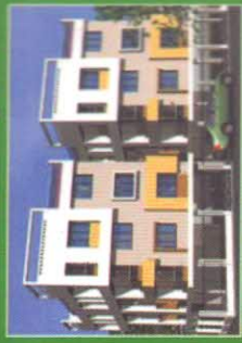
Purbalok, E M Bypass